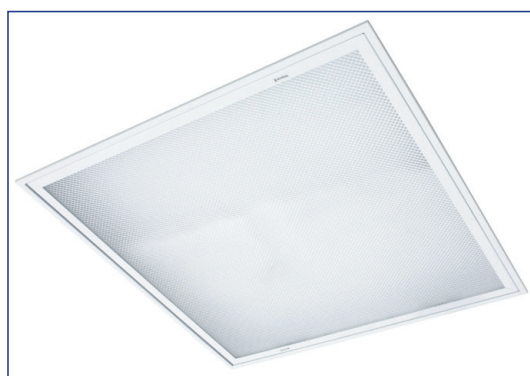
Hermetic 418 K58 OP HF