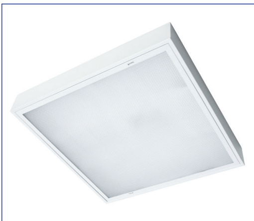
Hermetic T8/T5 surface mounted series