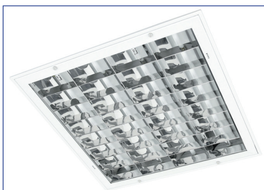
Hermetic 418 K58 IP65 PAR HF

Type: A range of IP54 rated recessed and surface luminaires provides an ideal solution for food processing, pharmaceutical or medical applications. Outstanding design and look.